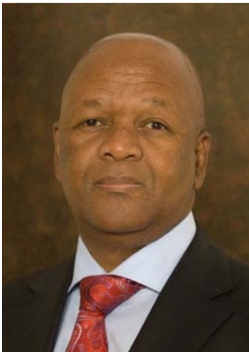
Minister J.T. Radebe

The South African Government is committed to establish a society that is free from all forms of violence, particularly those perpetrated against the most vulnerable persons. Recently, our country experienced a spate of sexual crimes committed against children, lesbians, and persons with disabilities. Some of these gruesome crimes made international news, and placed South Africa under the global spotlight. This criminal behaviour is totally unacceptable and will not be tolerated. It is the commitment of the Department of Justice and Constitutional Development (DOJ&CD) not to rest until sexual violence is uprooted in all its form from all communities.